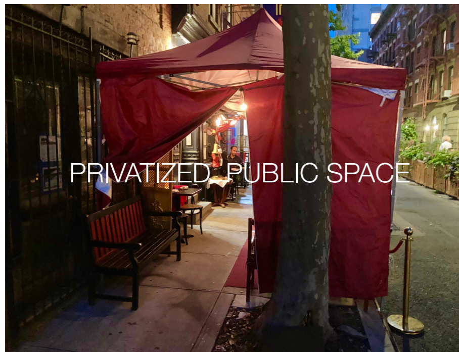
PRIVATIZED PUBLIC SPACE