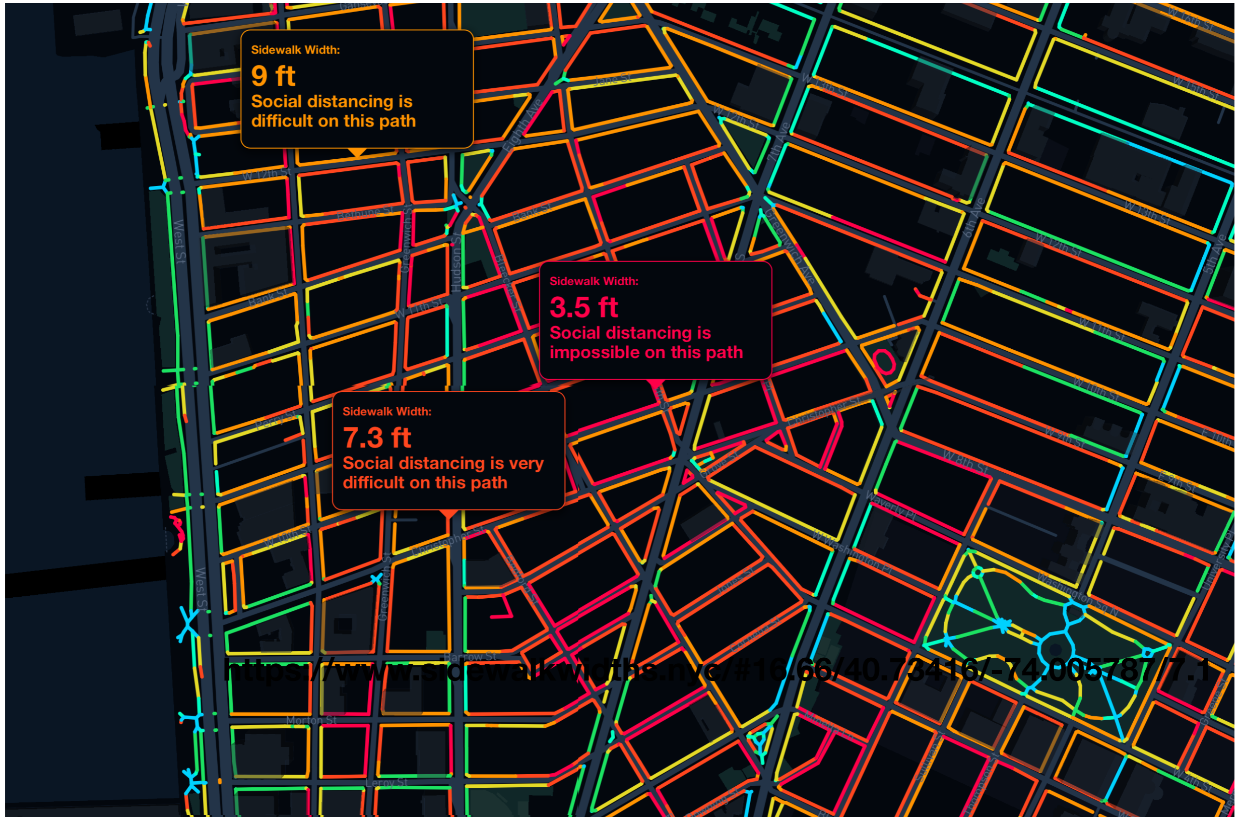
EXHIBIT 2: WEST VILLAGE SIDEWALKS